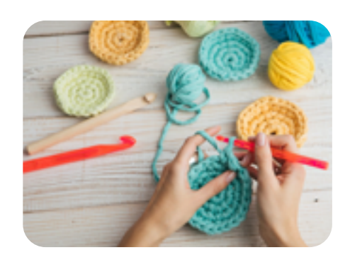
Crochet and Fiber Arts