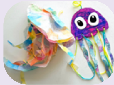
Mixed Media Jellyfish