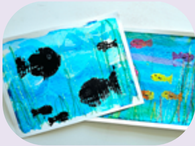
Underwater Scaper Painting

Mommy and me class for walking toddlers to age 3