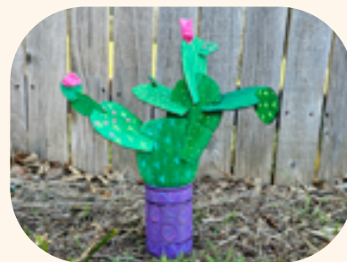
Cardboard Cactus Sculptures