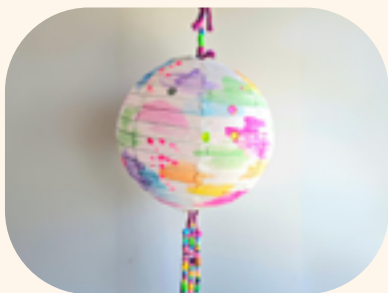
Painted Paper Lanterns